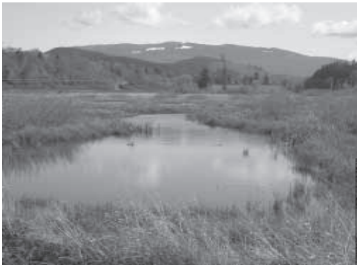
The Butlerer Flats Conservation Area offers bird and wildlife watching from Green Road outside of Burlington.

Of course, some properties are just too sensitive to allow access. The March's Point Heronry is an example of one of the few Trust properties that is closed to public access. The nesting herons are sensitive to disturbances, yet people are very curious about them. So we have created two ways for people to see the